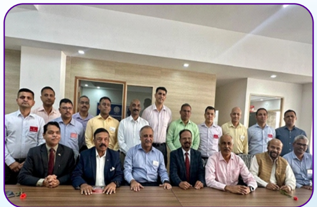
Defence college visit to BMA office on 14th Dec 2023