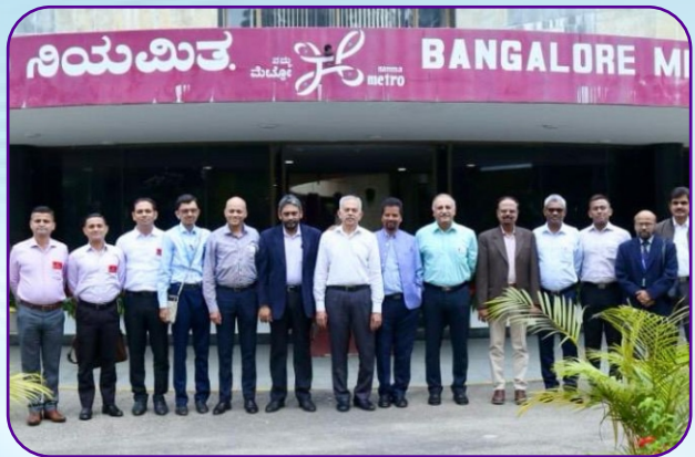
BMA President, members of BMA and Defence college team visit to BMRL Byappanahalli on 15th June 2023