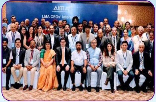
LMA CEOs' Interaction Meeting with AIMA President Dated 10th April 2023 at Delhi.