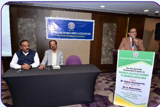
One day executive development programme on BUSINESS ANALYTICS PATHWAY to business excellence held on 23-12-2022